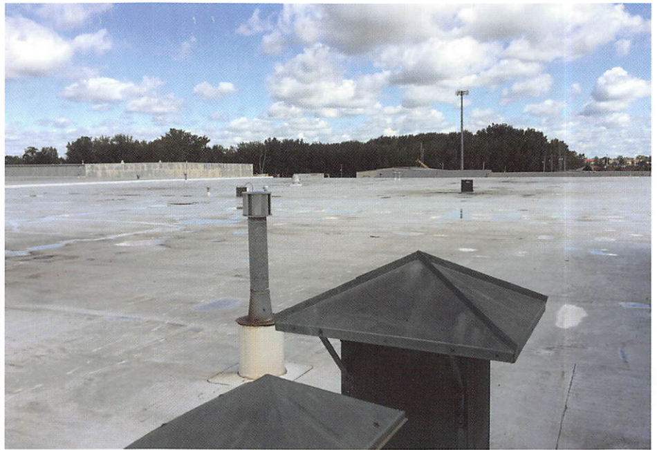
RAV Properties (Thompson Road, Syracuse) - Insulated TPO (Thermal Plastic) Roof, 140,000 Sq,Ft

Shaffer Building Services and Giarrosso Sheet Metal employ 27 full-time and one part-time employee.